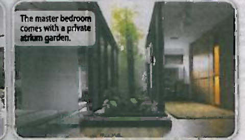
The master bedroom comes with a private atrium garden.