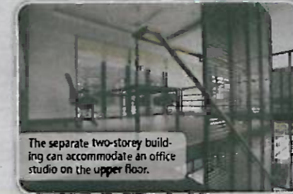
The separate two-storey building can accommodate an office studio on the upper floor.