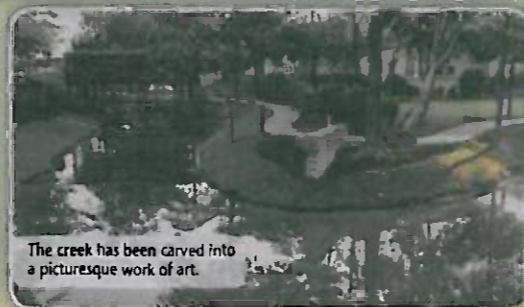
The creek has been carved into a picturesque work of art.

There's good news for residents of Leisure Farm Resort! The Bale Equestrian and Country Club, the resort's main clubhouse will be undergoing a major "green" expansion and facelift to add close to 40,000sq ft of space to its current 18,000sq ft.