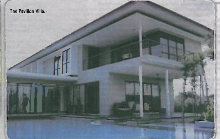
The Pavilion Villa.