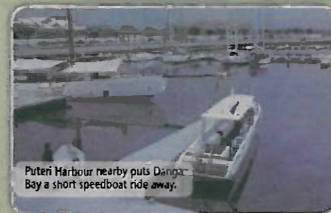
Puteri Harbour nearby puts Danga Bay a short speedboat ride away.