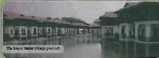
The Bayou Water Village precinct.