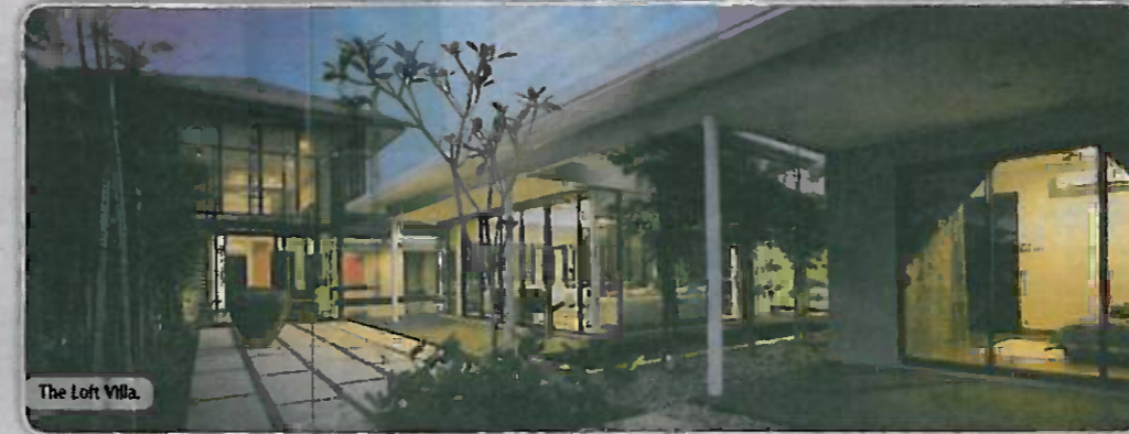
The Loft Villa.

The living room flows into the dining and dry kitchen area, which looks quite majestic with its double volume ceiling. The four baths have alfresco-style shower areas that permit occupants to look up to the sky but without being seen.